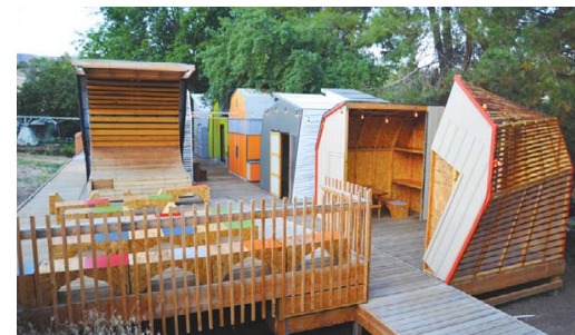
Cabins: ACE project in Sun Valley.