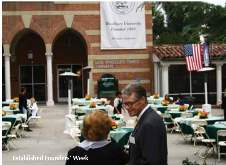
Established Founders' Week