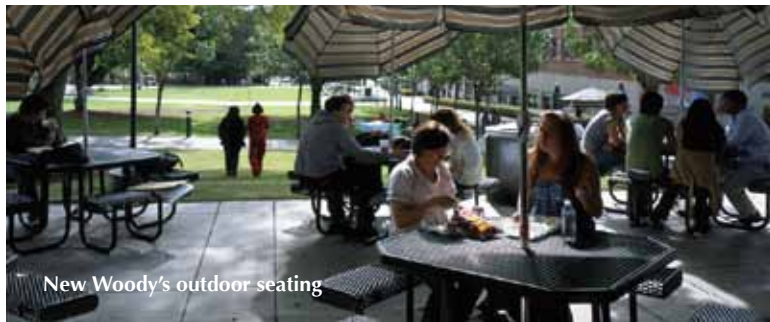
New Woody's outdoor seating