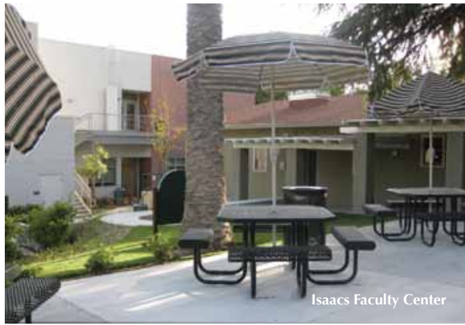
Isaacs Faculty Center