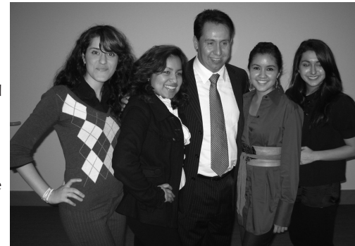
Students pose with Consul General from Mexico

Woodbury University is proud to be included on the Education Trust's list of private institutions that succeed in graduating Latino students at rates similar to those for white students. The report, "Big Gaps, Small Gaps: Some Colleges and Universities Do Better Than Others in Graduating Hispanic Students," contends that what universities do to promote student success has a tremendous impact, especially for Hispanic students.