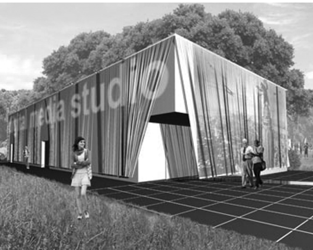
New media center

Three new degrees in digital media coming to Woodbury Three new degrees in digital media are coming to Woodbury's School of MCD by virtue of a new Title V grant. Filmmaking, Video Game Art and Design each begin Fall of 2011. Media Technology will begin in Fall 2012.