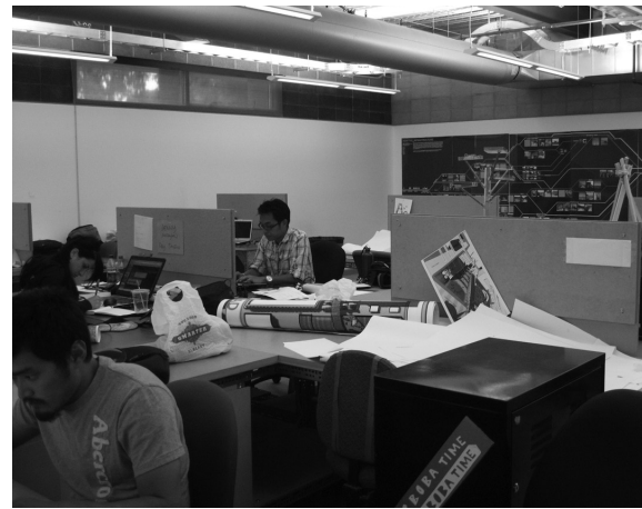
Students in Studio

Design Futures Council created the study as a way for the industry's leading practitioners to rank accredited undergraduate and graduate programs.