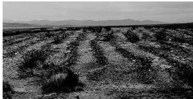
Southern California arid landscape

Working during the school year with the City of Burbank, and in the summer term with Rio Arriba County, New Mexico, Woodbury's students and faculty provided no-cost planning and design assistance to low-income communities working to devise sustainable water and energy strategies in the face of climate change. The work is part of the Arid Lands Institute (ALI) at Woodbury University and is being supported by a three-year, $600,000 grant from U.S. Department of Housing and Urban Development (HUD). The community partners have pledged over $100,000 in donated technical assistance from planners, engineers, and water commissioners.